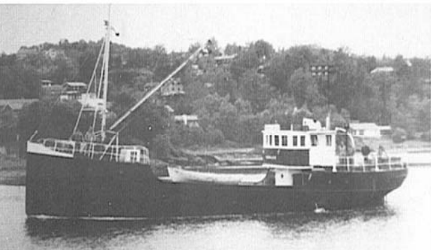
Today the ship is original, apart from rigging and bridge house.

FINANCING: Since 1981, $500,000 has been used to restore this ship. It can be made steaming for half of this amount, and fully restored for less than one million. Previous work has been done through private effort and in connection with government financed work training programs for youths. Teenagers have actually riveted the repaired superstructure.